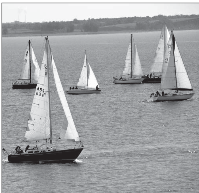
For the first time in a decade a sailboat regatta returned to Lake Sakakawea. The Fort Steveson Sailboat Regatta took place Aug. 24, but light winds kept most boats from finishing the course.

I would be negligent if I did not mention the great outdoor opportunities that lay ahead in the upcoming winter months. Get out and ski, snowshoe and hike at any of the parks in the coming weeks and months. For the hardy souls among us, spend a night or weekend winter camping. For others maybe a yurt or cabin at several of the parks is more appealing. Consider a trek to the recently opened back-country cabin at Lake Metigoshe State Park—Osprey Cabin. Check out the Department's website at: www.parkrec.nd.gov for complete information.